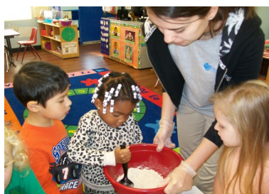
Cooking in Classroom 02

May 2- Parent Meeting @ 6pm May 4 & 25- Good Works Reader May 16- Transition to Kindergarten Meeting @ 2pm May 22- Field Trip May 25- End of Year Celebration May 26- Last Day of School, Dismissal @ 12:30pm