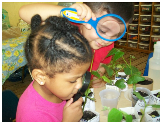
Exploring and Learning in Classroom 01