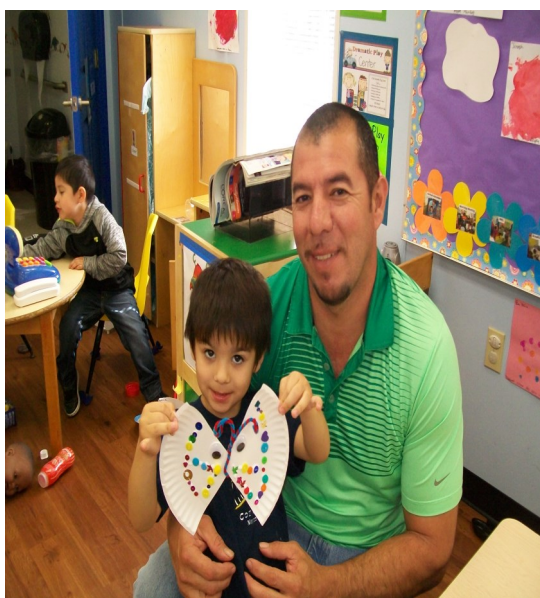
Parent Involvement Classroom 2

The next Policy Council meeting is scheduled for Thursday, April 27 th at 10 am. It will be a face to face meeting at Holiday Inn Express in Leesburg, Florida.