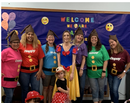
Chisholm Head Start and Early Head Start Spirit Week.