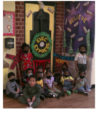
EVEC, class 4 entered into the door competition, we wish them Good Luck!

I hope that everyone had a wonderful holiday season and is ready for the New Year! We are going to finish up our study on Pets and then by the end of the month we will be starting a study on insects. The children are continuing to learn to recognize their names and how to trace them. We are reviewing shapes and colors and working on recognizing numbers. Please continue to talk and read to your child as often as you can! Take Care!