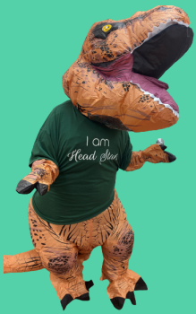
Special appearance by Teachable T-Rex!

Saturday, June 19th 11245 Spring Hill Drive Spring Hill, FL 34609 9am-2pm