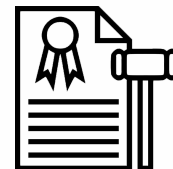
Proof Of Custody