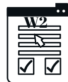
Proof of Income (If Applicable)